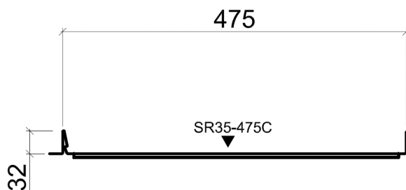
Front section view