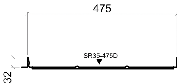
Front section view